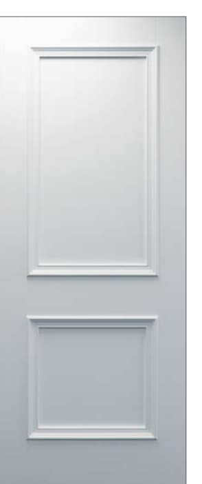
Balmoral 2 Panel