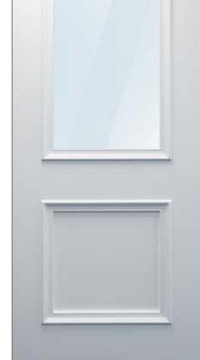
Balmoral I Lite