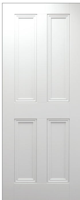
Harberton 4 Panel

78"x30"x40mm (153707) 78"x33"x40mm (153706)