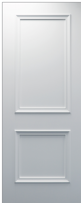
Balmoral 2 Panel

78"x30"x40mm (153715) 78"x33"x40mm (153714)