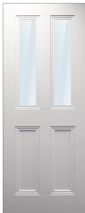
Harberton 2 Lite