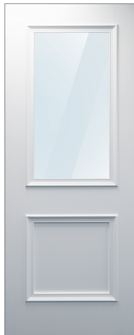
Balmoral I Lite